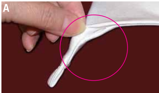
Locate the seam opening just under hanging tab (A).