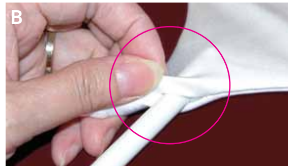
Insert the center pole into opening and feed through across the shape into opposite point (B).