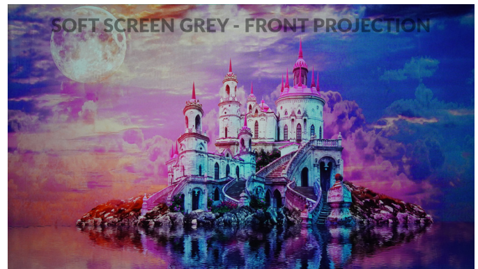
Hi Gain, wide viewing angle. Minor stretch for easy installation. Wrinkle resistant, low iron or gentle steam