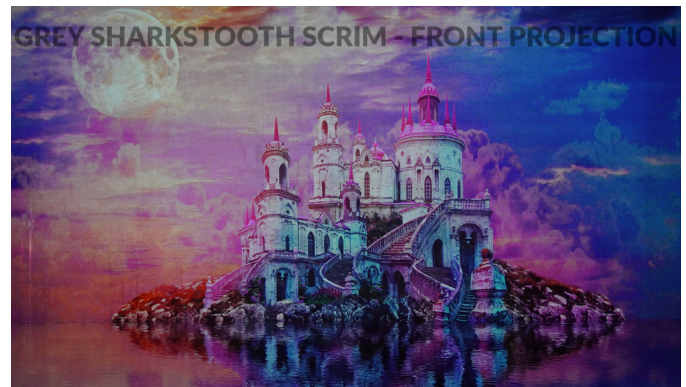
Wrinkles easily removed with iron or hot water