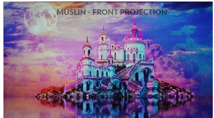
Best choice for extra wide. Wrinkles easily removed with iron or hot water