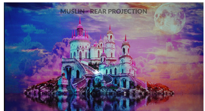
Minimal hot spotting.