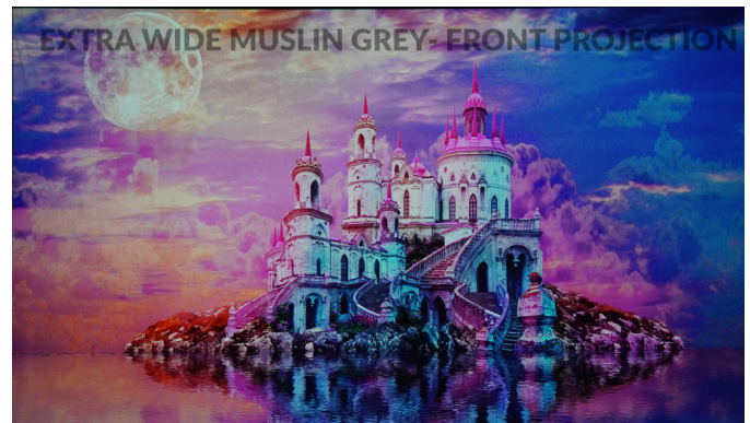
Best choice for extra wide. Wrinkles easily removed with iron or hot water