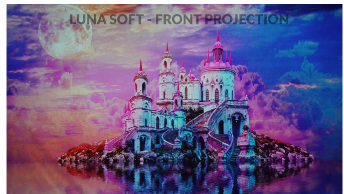
Hi Gain, wide viewing angle. Minor stretch for easy installation. Wrinkle resistant, low iron or gentle steam