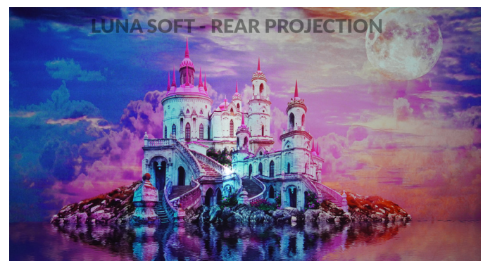
Minimal hot spotting.