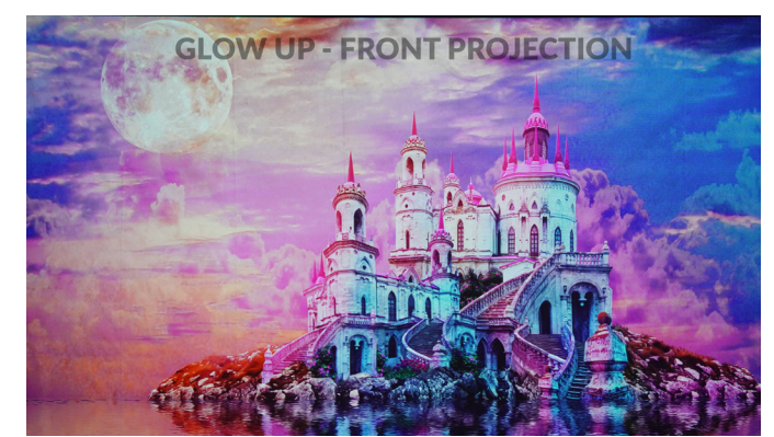
Steam to remove wrinkles. Stable, minimal stretch. Use with coated side AWAY from audience.