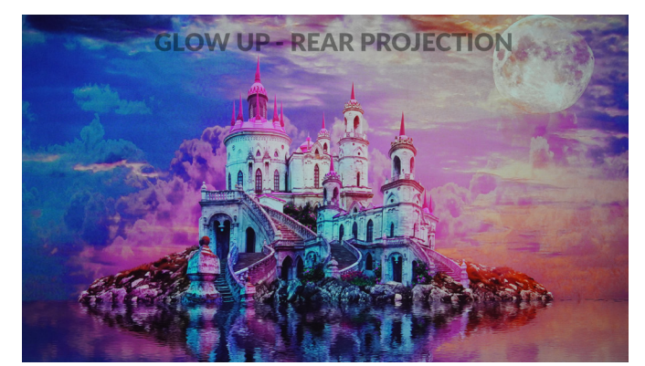
Best for rear projection, No hotspotting