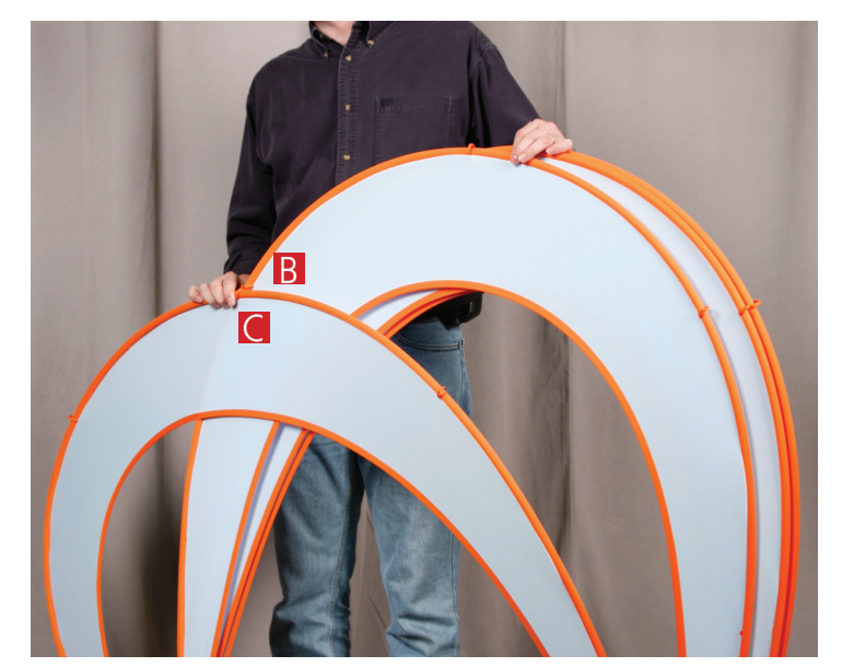
Attach Loop C to Loop B of next petal.