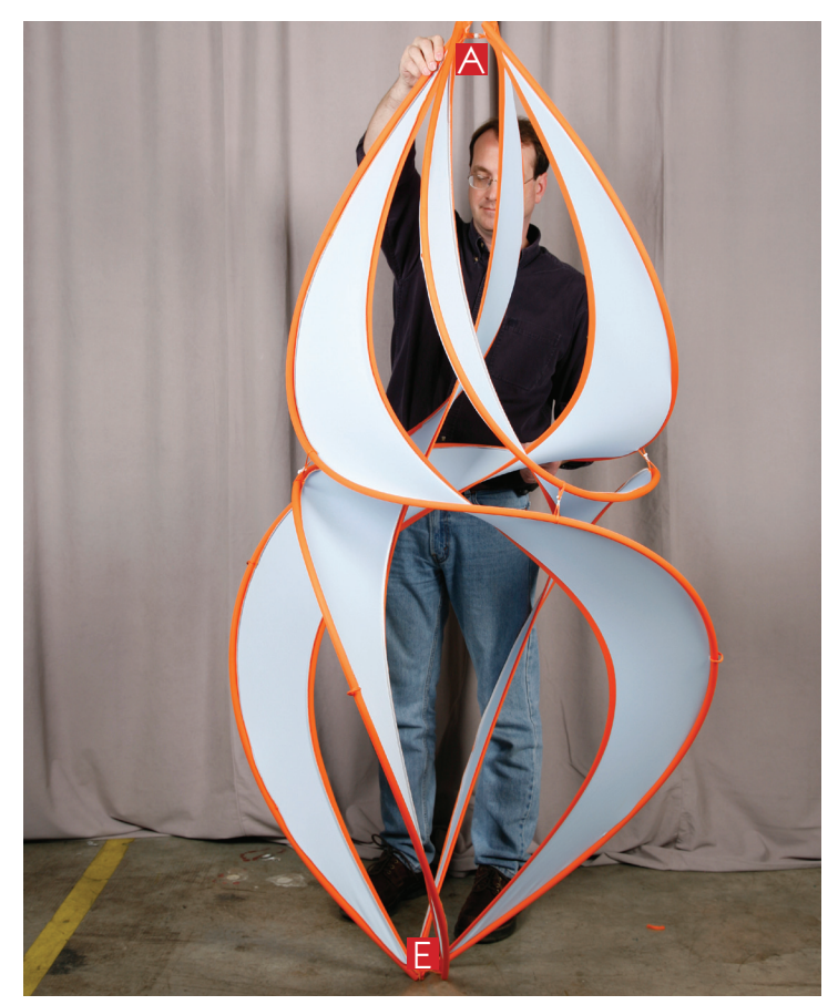
Attach final B Loop to C Loop using butterfly twist clip.