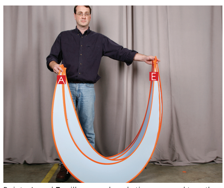
Points A and E will come already tie wrapped together; if not attach all point A together and point E together.