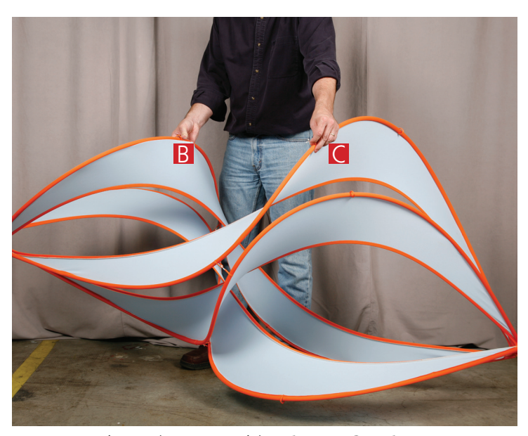
Rotate and continue attaching Loop C to Loop B on each petal.