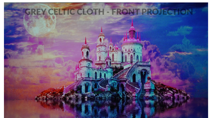
Hi Gain, wide viewing angle. Minor stretch for easy installation. Wrinkle resistant, low iron or gentle steam