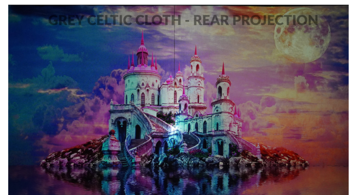
Minimal hot spotting. Minor sparkle artifacts through knit.