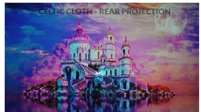
Minimal hot spotting. Minor sparkle artifacts through knit.