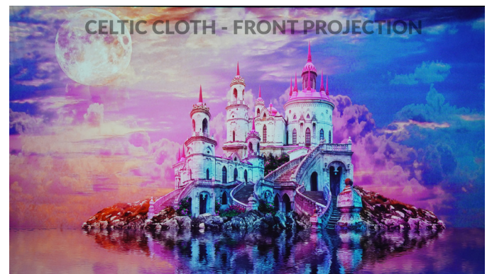
Hi Gain, wide viewing angle. Minor stretch for easy installation. Wrinkle resistant, low iron or gentle steam