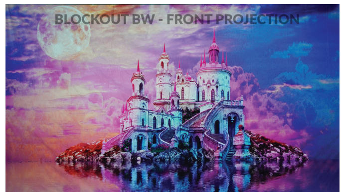
High Gain, 90% opaque for cross overs and US lighting. Some glow-through with intense direct light. Stable, minimal stretch.